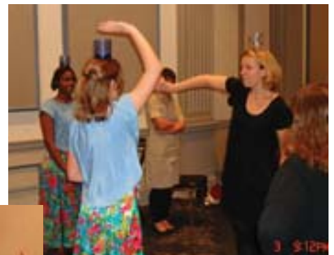
The Penn State International Dance Ensemble teach PaCIE members the Candle Dance at the Awards Banquet