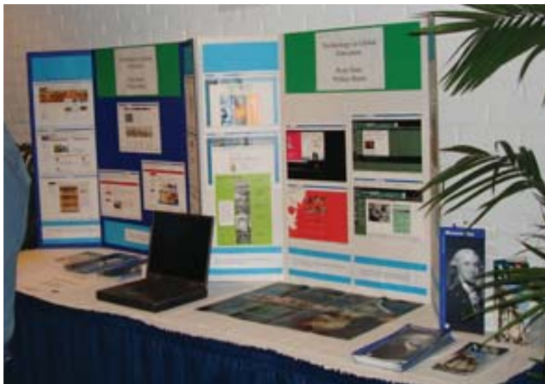
Displays at Friday's Poster Session