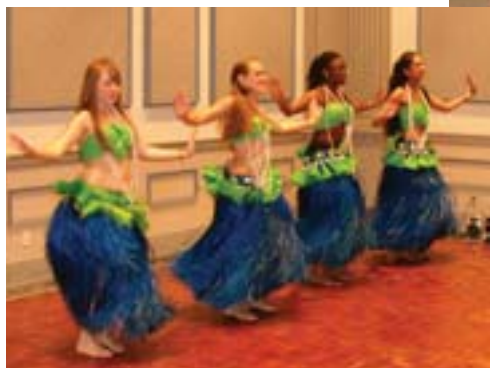
The Dance Ensemble performs a Tahitian dance