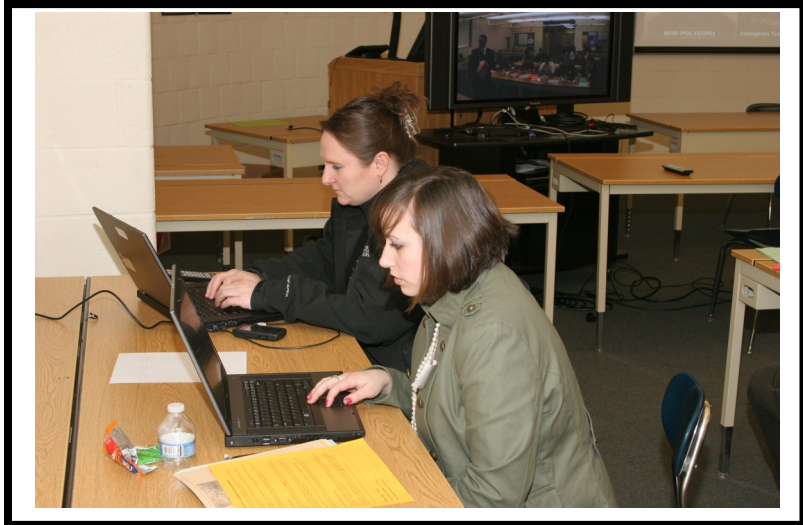
A student monitors the Twitter feed.

Shouldn't technology play a larger role in not only mitigating, but also communicating about natural disasters when they hit? Students in the Pittsburgh area thought so as they joined a community of fellow students and experts from around the world via live high-speed multipoint videoconferencing on March 3 rd to discuss recent effects of natural disasters, public policy implications, and more. Approximately 500 students from 15